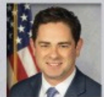
Rep. Kyle J. Mullins 112th Legislative District