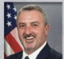
Rep. Kyle T. Donahue 113th Legislative District