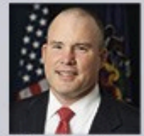
Sen. Marty Flynn 22nd Senatorial District