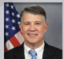
Rep. Jim Haddock 118th Legislative District