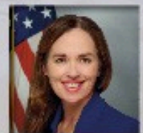
Rep. Bridget M. Kosierowski 114th Legislative District