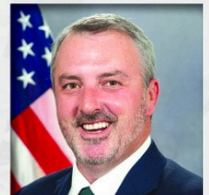
Rep. Kyle T. Donahue 113th Legislative District