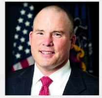
Sen. Marty Flynn 22nd Senatorial District