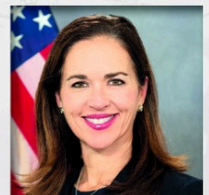
Rep. Bridget M. Kosierowski 114th Legislative District